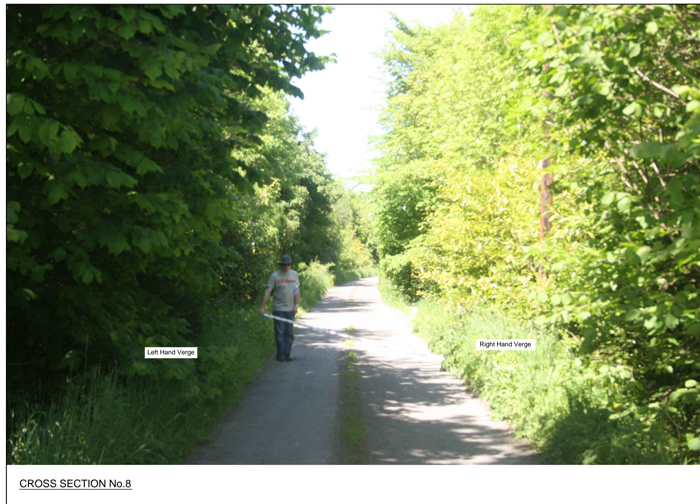
CROSS SECTION No.8

LAYOUT PLAN Scale 1:5,000 Reproduced from the Ordnance Survey by Permission of the Government Licence No. EN 0002613 based on Map Reference 3048, 3049, 3114 - 3117, 3180 - 3183, 3246 - 3249 @ 1:5,000