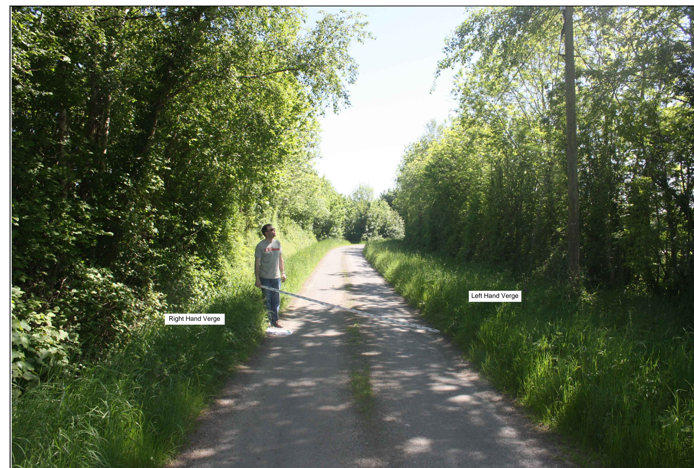
CROSS SECTION No.9