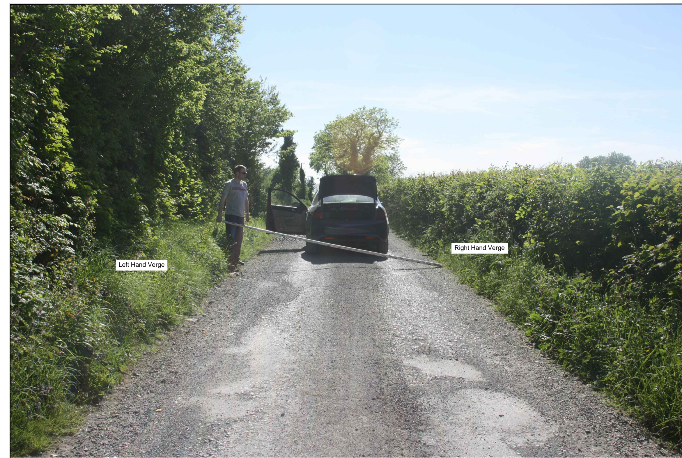
CROSS SECTION No.13