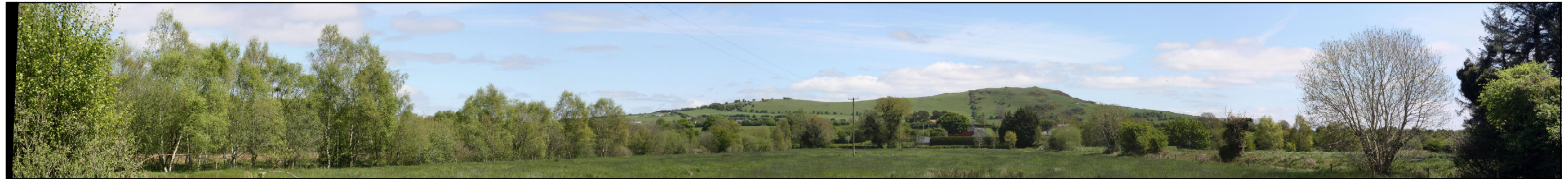
Full Photomontage View (FV)