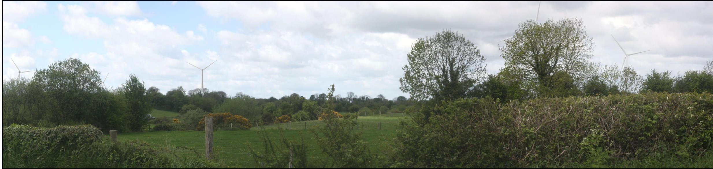
Partial Photomontage View (PV)