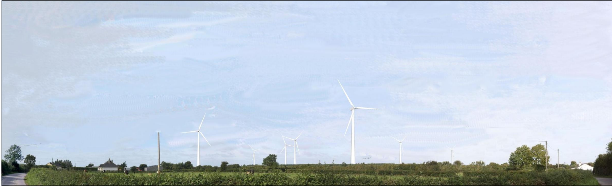
Full Photomontage View (FV)