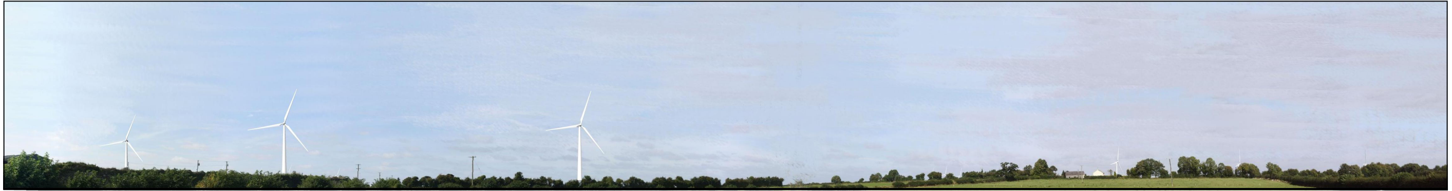
Full Photomontage View (FV)