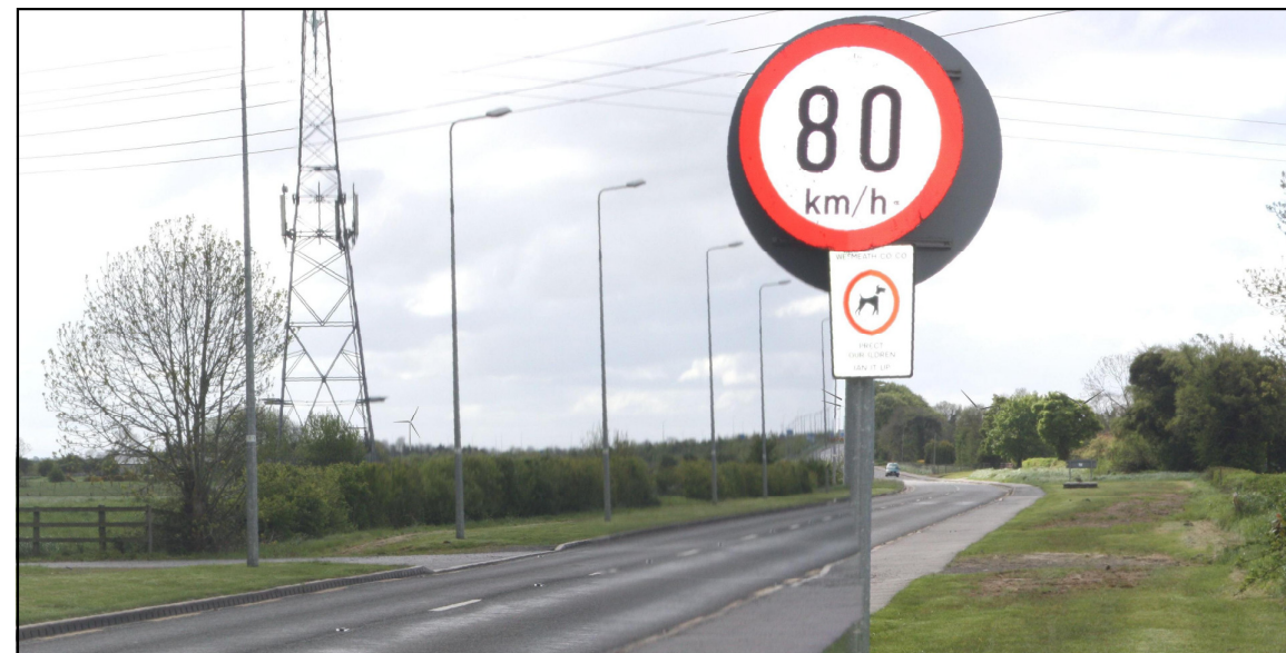
Partial Photomontage View (PV)