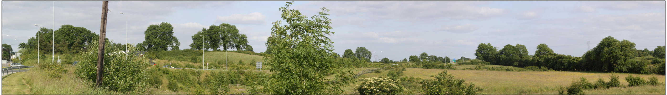
Full Photomontage View (FV)