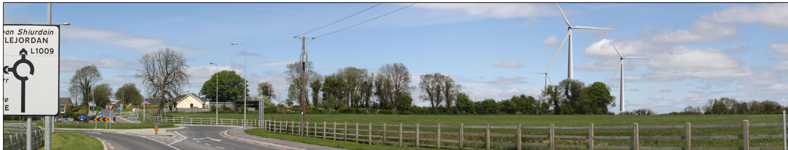
Partial Photomontage View (PV)