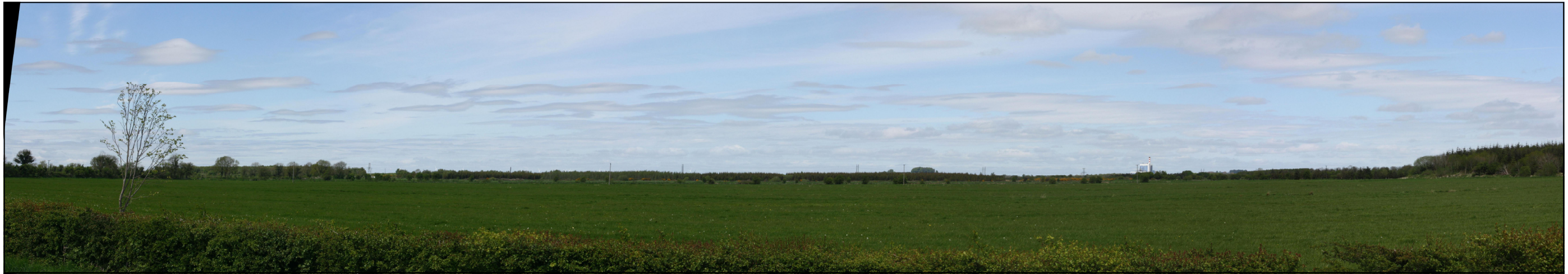
Full Photomontage View (FV)