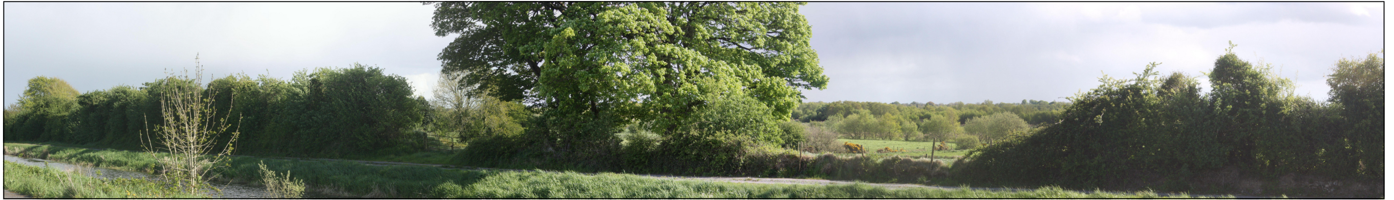
Full Photomontage View (FV)