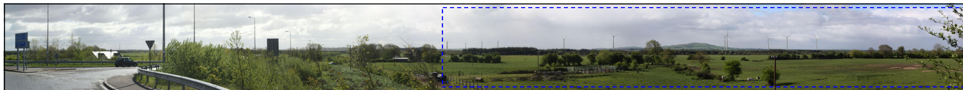
Full Photomontage View — Contextual