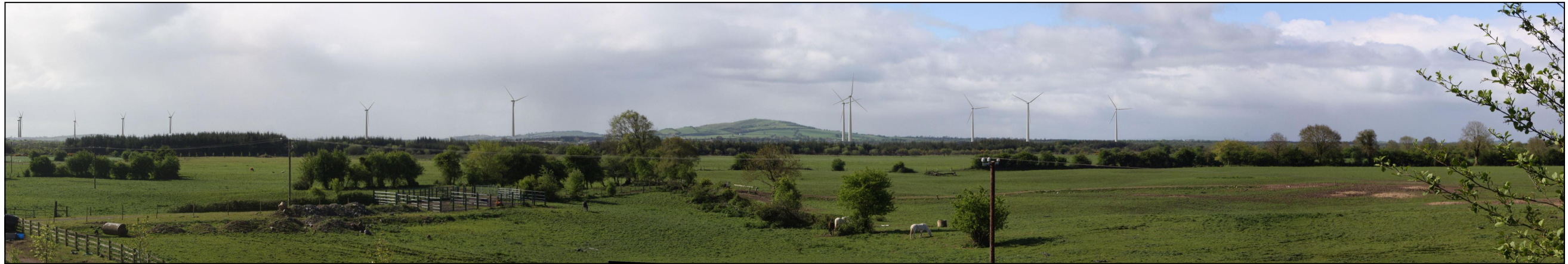
Partial Photomontage View (PV)