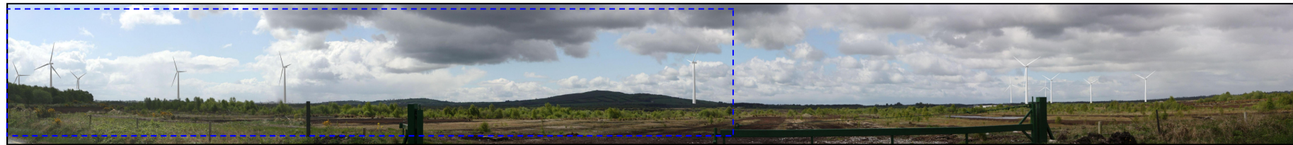
Full Photomontage View — Contextual