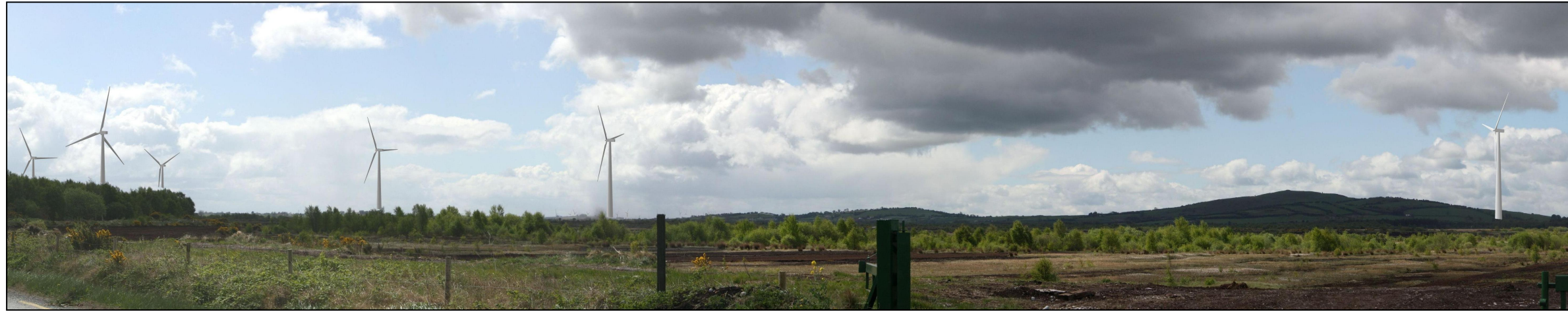
Partial Photomontage View (PV)