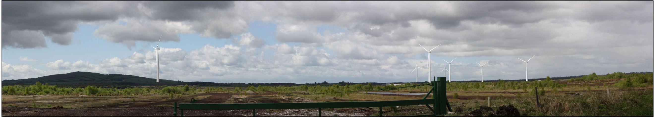
Partial Photomontage View (PV)