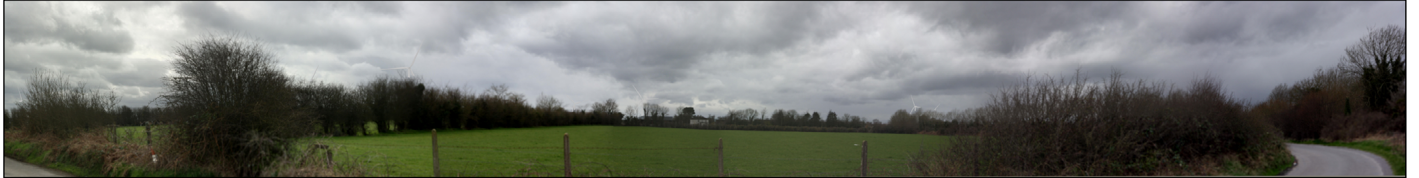
Full Photomontage View (FV)