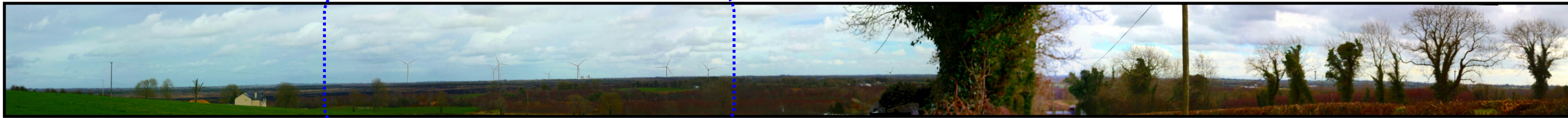
Full Photomontage View (FV)