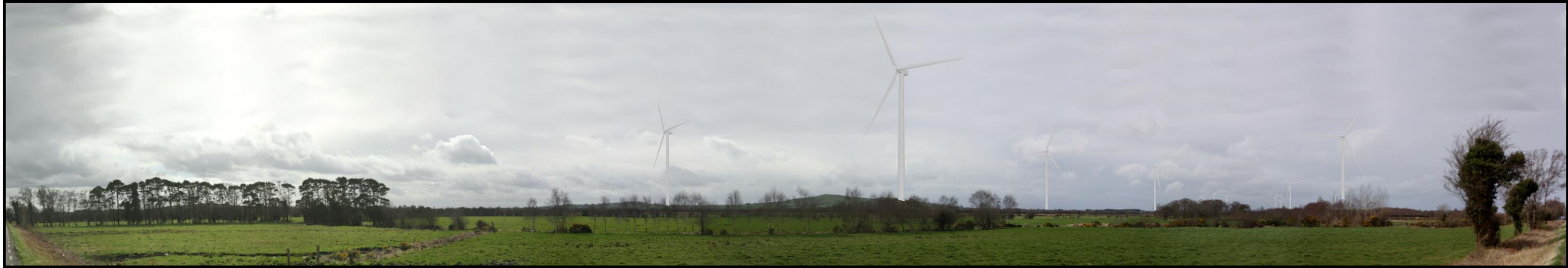
Full Photomontage View (FV)