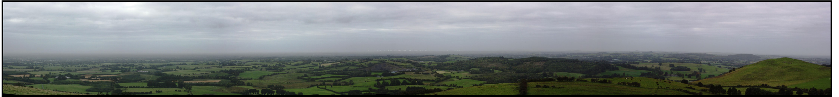
Full Photomontage View (FV)