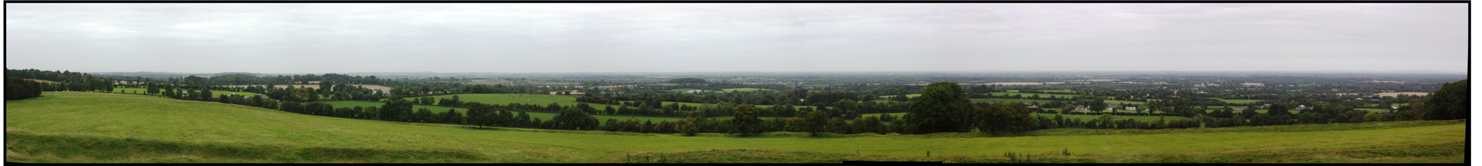
Full Photomontage View (FV)