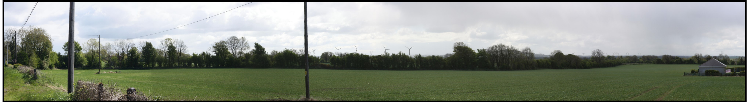
Full Photomontage View (FV)