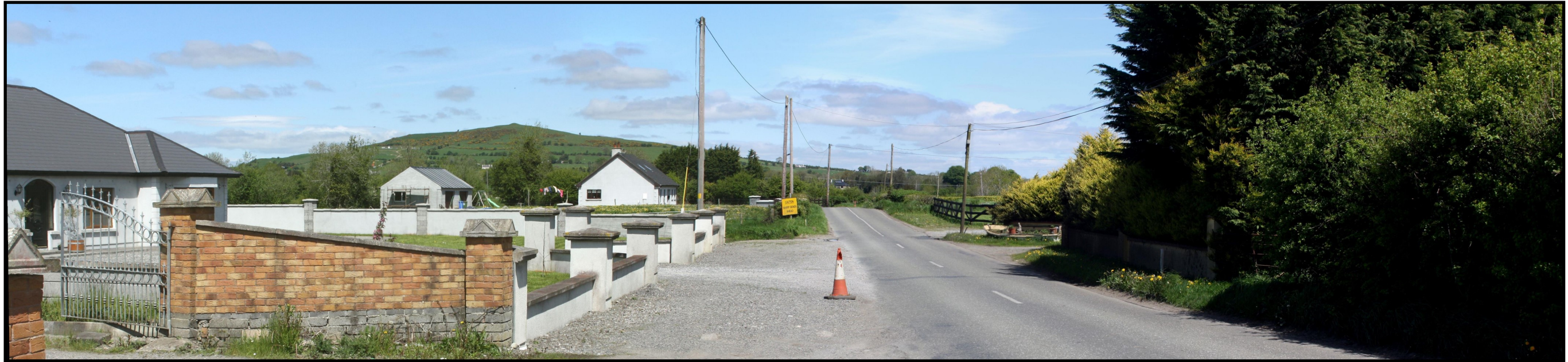
Full Photomontage View (FV)