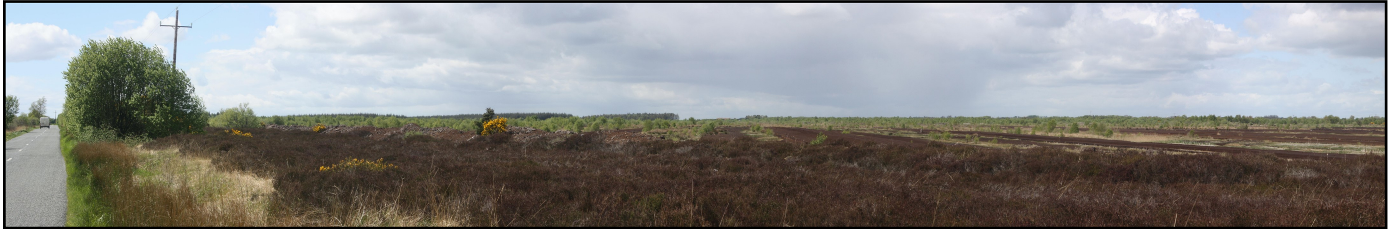
Full Photomontage View (FV)