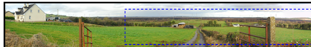
Full Photomontage View — Contextual