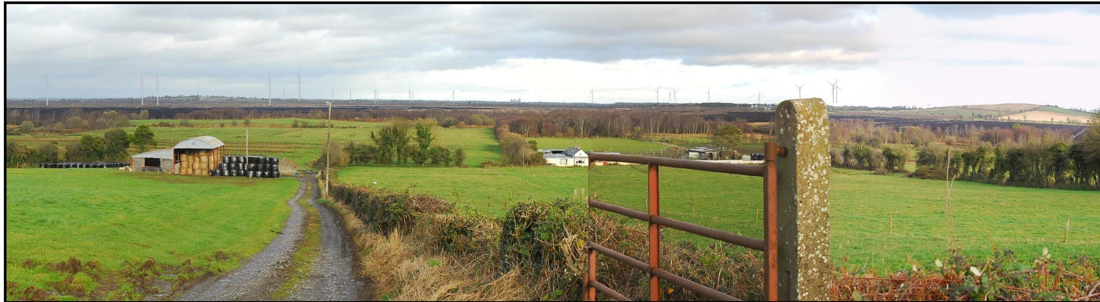
Partial Photomontage View (PV)