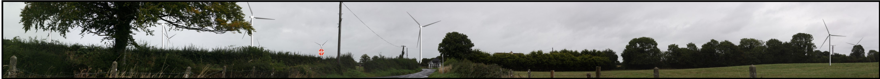
Full Photomontage View (FV)