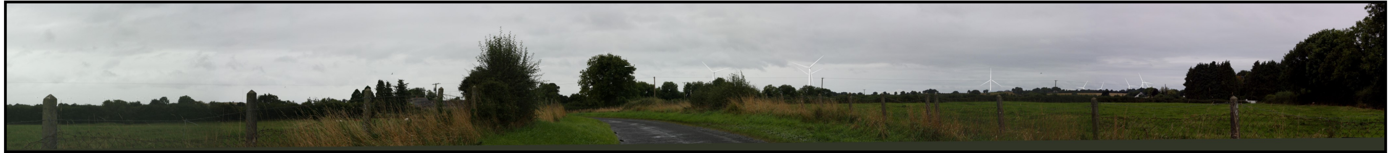
Full Photomontage View (FV)