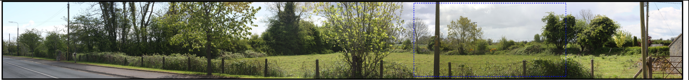
Full Photomontage View (FV)