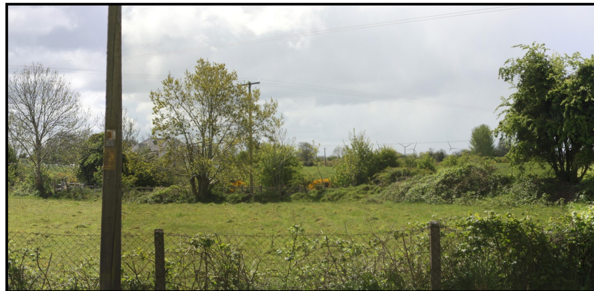
Partial Photomontage View (PV)