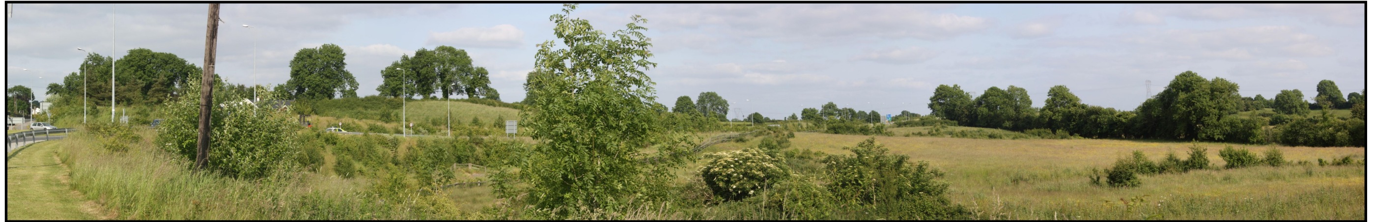
Full Photomontage View (FV)