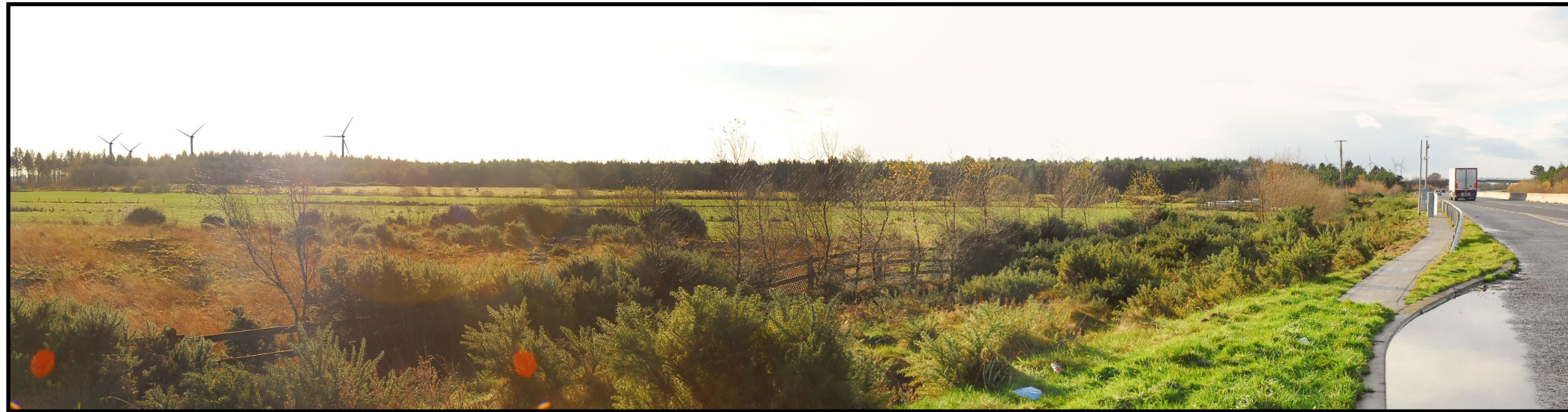
Partial Photomontage View (PV)