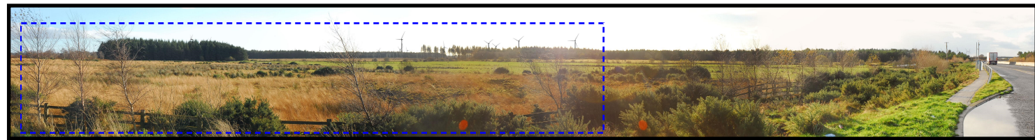
Full Photomontage View — Contextual