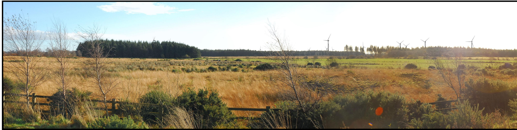
Partial Photomontage View (PV)