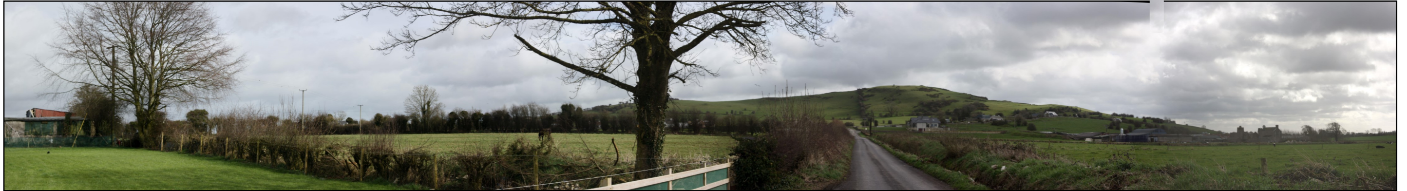
Full Photomontage View (FV)