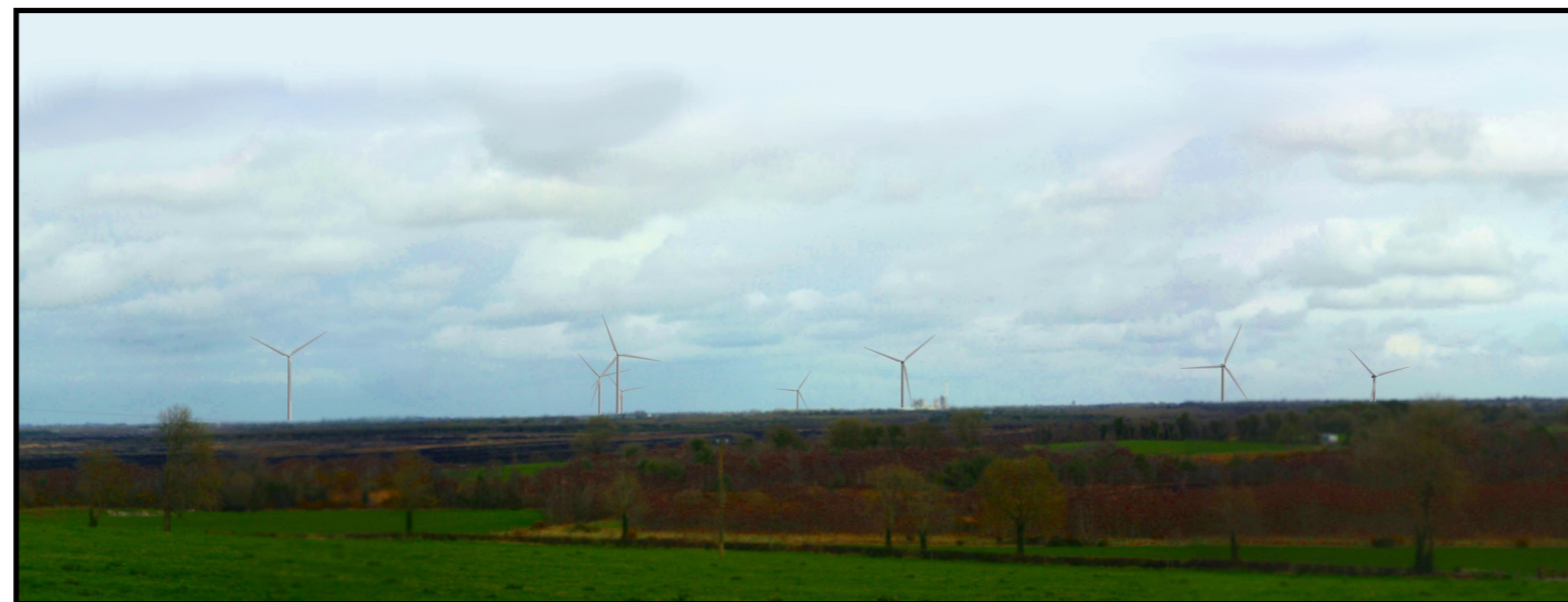
Partial Photomontage View (PV)