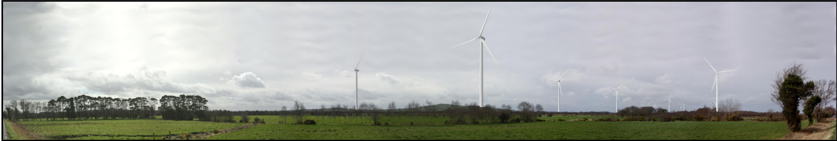
Full Photomontage View (FV)